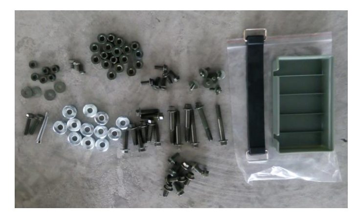
1.4.3 Bag 3: Steering wheel cover (1pc), cable for headlight (1pc), clamps for windshield (10pc), clamp cushion for windshield (4pc), plastic plug (2pc), self-locking nut M10X1.25 (2pc), bolt M5X25 (1pc), washer ∮ 5 (1pc), rear mirror mount and O-ring (1pc)

1.4.2 Bag 2: battery box (1pc), battery strap (1pc), bolt M8X55 (4pc), bolt M8X60 (2pc), bolt M8X30 (8 pc), bolt M6X16 (6pc), bolt M6X30 (2 pc), screw M6X16 (6 pc), bolt M6X12 (3 pc), washer \oint 6 (6 pc), cotter pin 3X40 (2pc), R-washer (12 pc), self-locking nut M8 (18pc), nut M6 (6 pc), bolt M8X16 (10 pc)