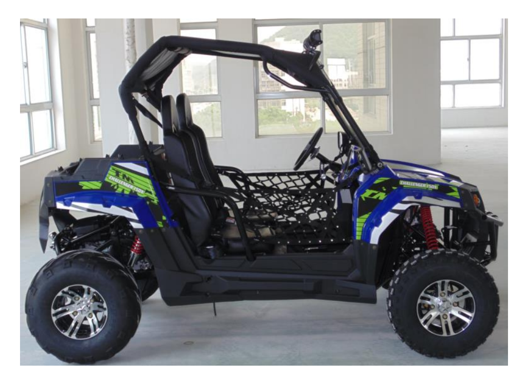
2.14 Install the safety belt: find the safety belt mounting plate welded on the frame near the seats, mount the safety belt on the mounting plates, and tighten the safety belt nuts.

2.13 Joint the front and rear roll cage: joint the roll cages and connect them with M8x30 bolt and M8 nut. The recommended torque is 22-29NM