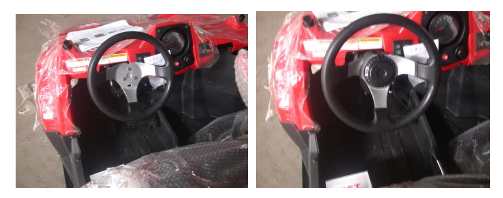
2.10 Adjust the steering wheel angle: loose the adjustment nut as shown in the picture, adjust the steering wheel to a comfortable height, tighten

2.9 Install the steering wheel: Use the M6x12 bolts to install the steering wheel onto the steering shaft, put on the steering bolt cover