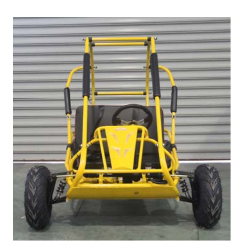
<u>NEW!!! SINCE 2012</u>

This set up instruction guides our customer to set up the go kart TrailMaster MID XRS step by step to ensure a correct assembly for safe driving.